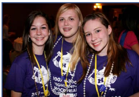
The Kentucky Team is all smiles showing off their pin exchanges