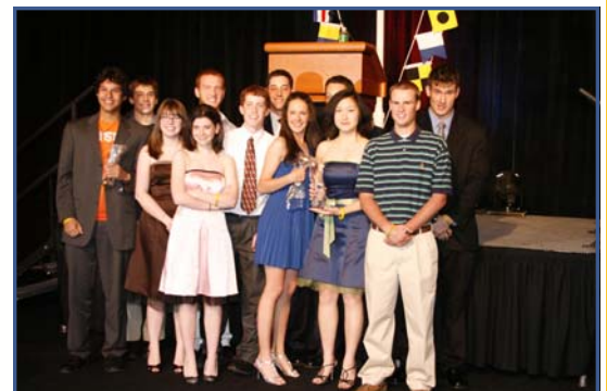
Delaware's own Charter School of Wilmington placed third in the National High School Mock Trial Championship