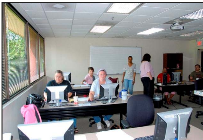
Members of the Core Team get ready on Sunday, June 1, 2008 at JJC for the Superior Court and Court of Common Pleas "Go Live"