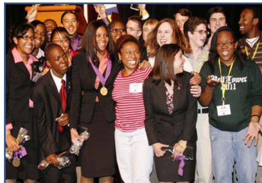
Students from Jonesboro High School, Georgia took First Place in the National High School Mock Trial Championship

Ruth Ann Minner recognized the team members and other guests.