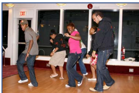
Dancing (Philadelphia Team) and fireworks aboard the Twin Capes Ferry