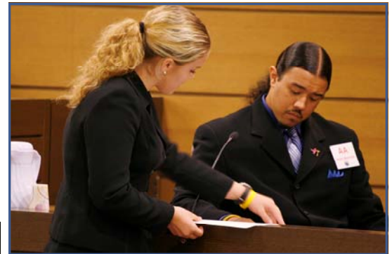
Georgia Team in trial

Forty-two teams from across the United States, as well as the Commonwealth of the Northern Mariana Islands, Guam and South Korea, arrived in Wilmington to participate in the 25 th Annual High School Mock Trial Championship held this year on May 7 th -11 th . Each of these teams had previously won the championship in their home jurisdiction and came to Wilmington ready to take on an even greater challenge in the 25 th Annual High School Mock Trial.