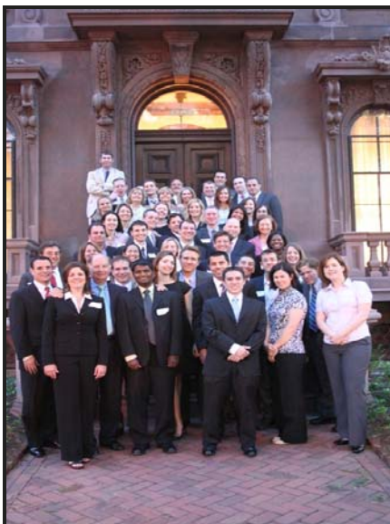
The Chief Justice outside of the Wilmington Club with 48 of his clerks