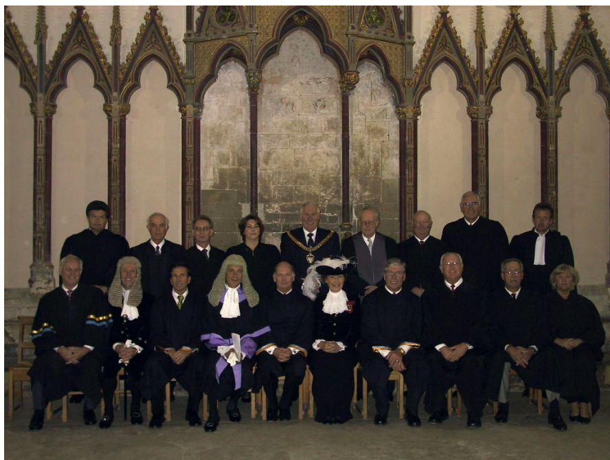
Delaware Judges from the Terry-Carey Inn of Court, photographed with their counterparts in Canterbury, England, at the ceremony to mark the opening terms of the Kent Courts, England.

The Inns are designed to enhance the skills, professionalism and ethics of judges and attorneys and have adopted a modified version of the traditional English model of legal apprenticeship, to help lawyers become more effective advocates and counselors. Inns meet approximately once a month to hold programs and discussions designed to augment members' skills and ethical awareness. The membership of each Inn consists of several categories based upon experience: Masters of the Bench – judges, experienced lawyers, and law professors; Barristers – lawyers with some experience who do not meet the minimum requirement for Master; Associates – lawyers who do not meet the minimum requirement for Barristers; and Pupils – third-year law students. Memberships are also divided into "pupilage" teams with each team consisting of members with different degrees of legal experience. Each "pupilage" team conducts one program for the Inn each year. Less experienced members are assigned to work with more experienced members who act as mentors, thus providing further opportunities for professional growth.