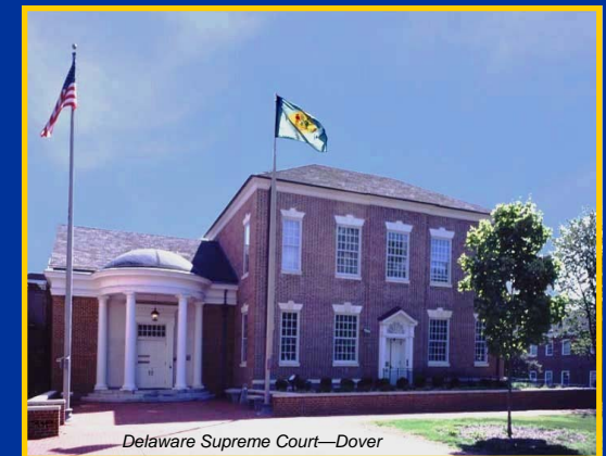
Delaware Supreme Court—Dover