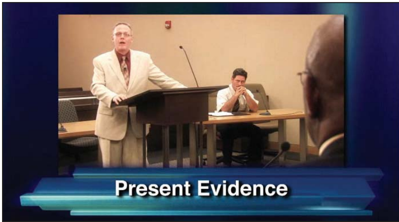
Screen print from the online video series for pro se litigants on civil case processing in the Delaware Courts.

Additional efforts serving the self-represented include the Court of Chancery's launch of an online accounting system that helps individuals serving as guardians or trustees prepare an accounting for filing with the Court and the Family Court's online filing of petitions in conjunction with nCourt.